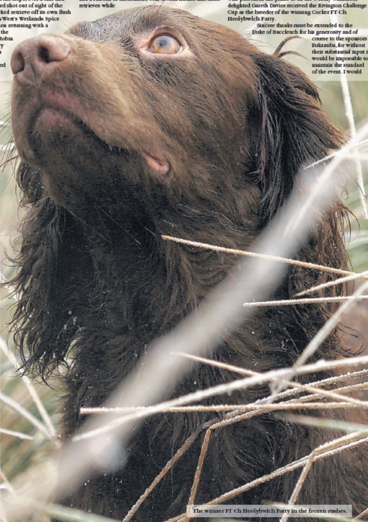
The winner FT Ch Heolybich Fatty in the frozen rushes.