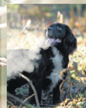
Third placed Charles Fearn's Selrach Daisy breathes heavily in the cold air.