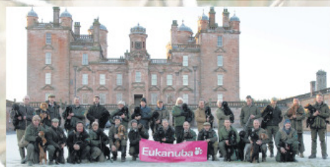
The historic line-up: 36 dogs qualified for this year's Championship.