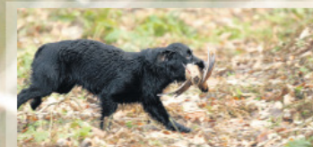
Simon Tyers' FT Ch Cheweky Twiggie retrieving a woodcock.