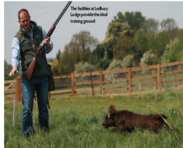
The facilities at Ledbury Lodge provide the ideal training ground